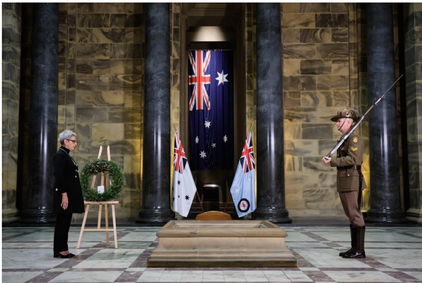
Her Excellency the Honourable Linda Dessau AC, Governor of Victoria in the Shrine's Sanctuary beside the wreath she lay on behalf of all Victorians, Anzac Day 2020.

The Shrine of Remembrance Melbourne was privileged to have more than 70,000 Victorians join them virtually for the live-streamed Anzac Day Dawn Service. It was a poignant moment to have Her Excellency the Honourable Linda Dessau AC, Governor of Victoria lay a wreath at the Stone of Remembrance on behalf of all Victorians, as thousands stood apart, but together in spirit, a very special Anzac Day for us all.