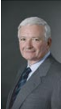
Nick Greiner AC