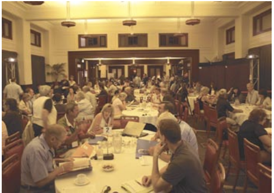
Australia's First Citizens' Parliament at Old Parliament House Canberra in 2009.