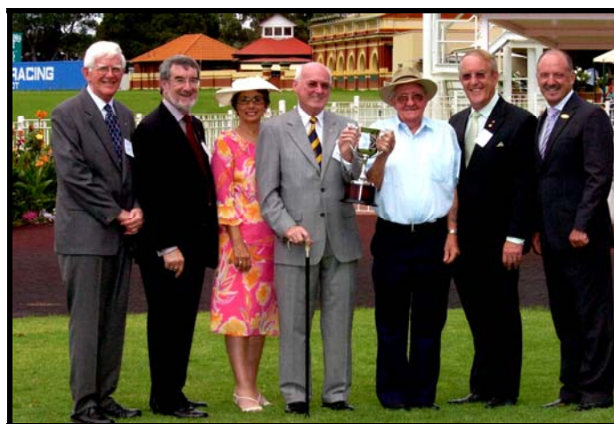
Executive members with the Australia Day Cup winner and WA Turf Club representative (far right).