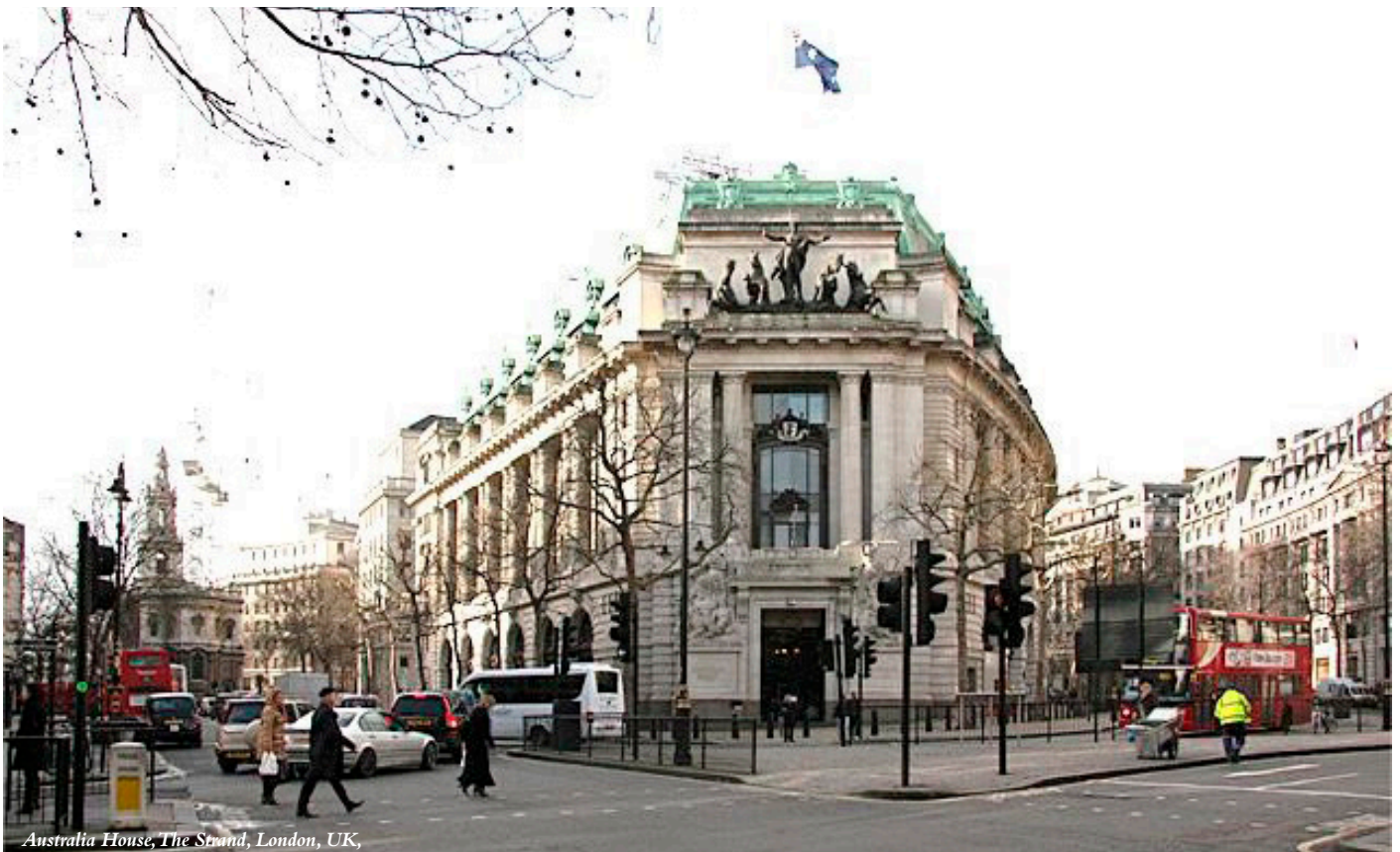
Australia House, The Strand, London, UK,