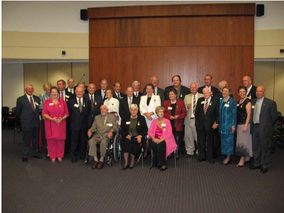
Australia Day award recipients at reception on 04 April 2008