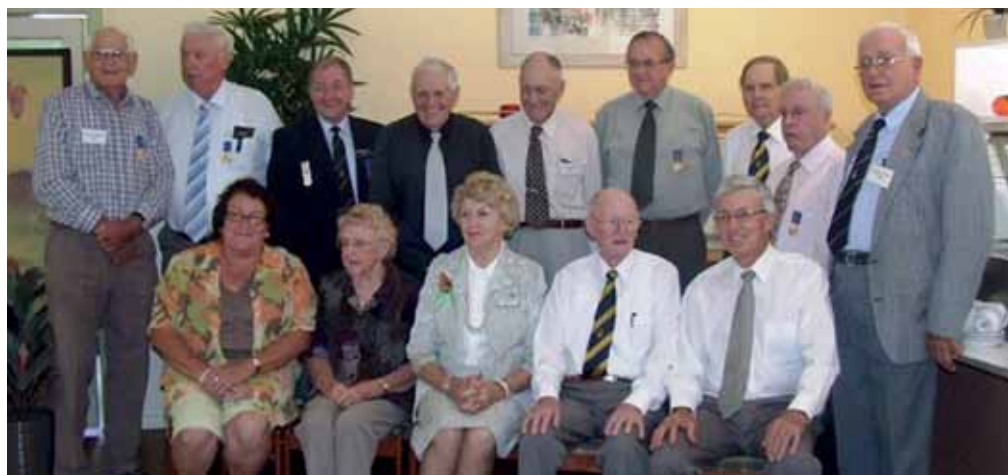
OAA members at Gayndah lunch