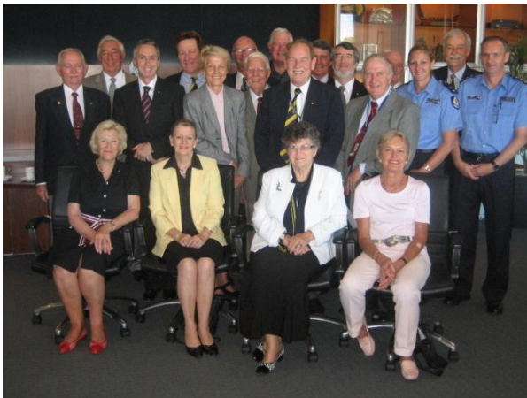
Patrons Meeting, 24 th November 2009