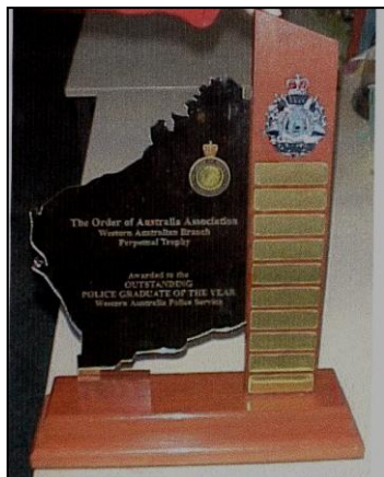
The Perpetual Trophy