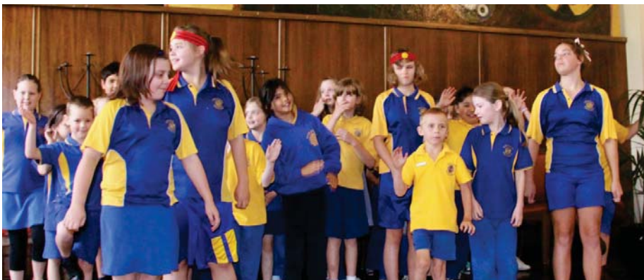
Giralang Primary School students perform a welcome dance at the the awards ceremony.