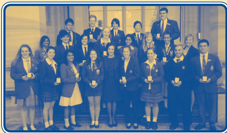
24.11.10 Government House, Sydney - H.E. Professor Marie Bashir AC CVO with the Awardees, after the presentation of the NSW Branch Medallion to each of them.