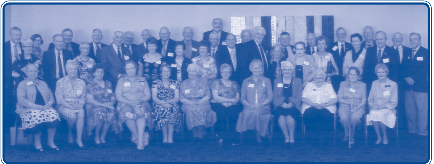
Above: 30.10.10 Dubbo Regional luncheon, RSL Club