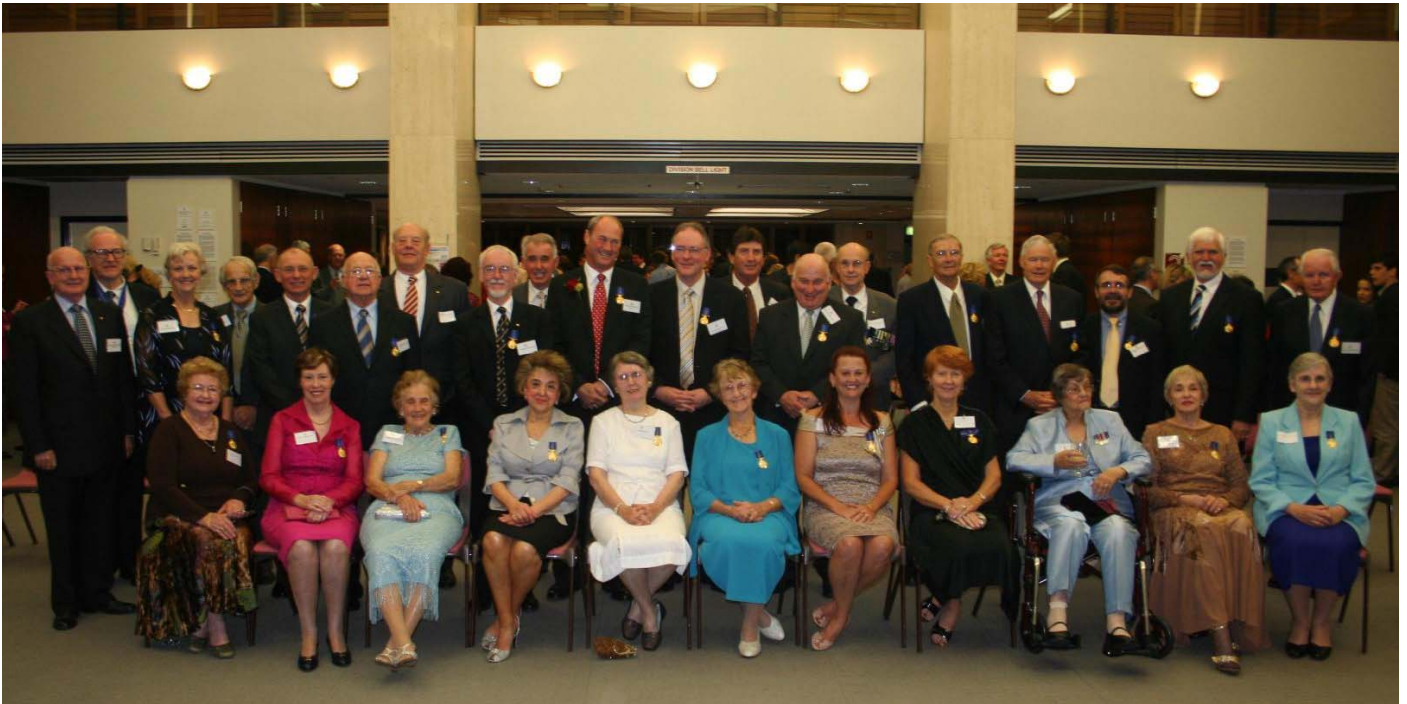
Recipients of Queens Birthday Honours 2007, who attended a Reception held in their Honour by the Qld Branch of the Association in The Parliamentary Annexe on Sept 14th 2007.